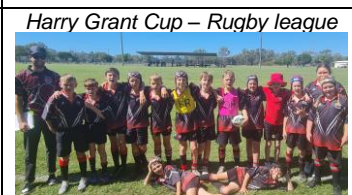
Harry Grant Cup – Rugby league