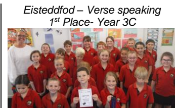
Eisteddfod – Verse speaking 1 st Place- Year 3C