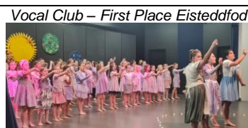
Vocal Club – First Place Eisteddfod